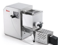
Optional pasta cutter