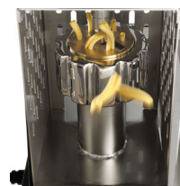
Knife pasta cutter