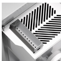
Removable funnel to add liquid ingredients during processing