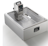
Container 2/1 gastro