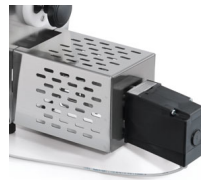
Optional variable speed pasta cutter