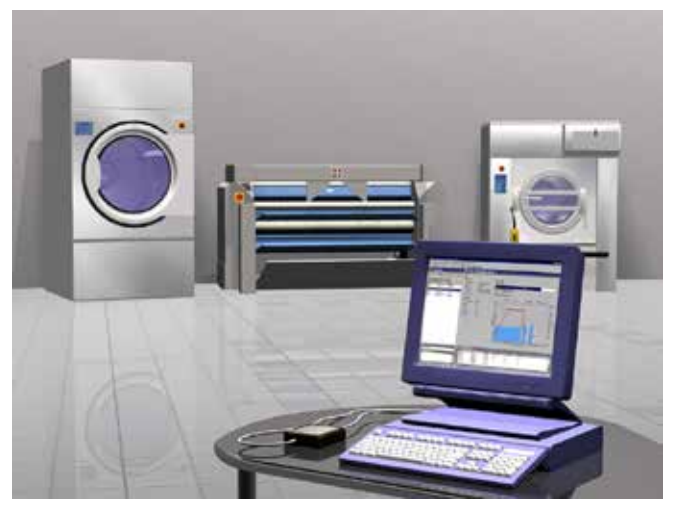
CMIS can be fitted to washer extractors with Clarus Control, tumble dryers with Selecta Control and ironers with electronic control system. All you need to access and view the statistical feedback is a normal PC.

• WPM PC program. Allows the creation of wash programs on a PC and their transference to the machine via a memory card.